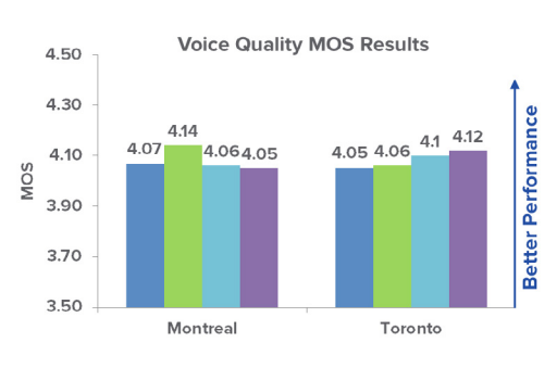
■ Operator 1 ■ Operator 2 ■ Operator 3 ■ Operator 4